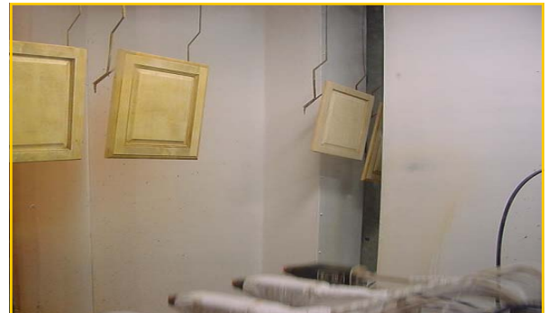
Product Transferred by Conveyor Through Automatic Application Recirculating Spray Booth.

Santa Fe Springs, CA – Typically, liquid paint finishing systems are used to coat a variety of products using spray booths equipped with automatic paint application equipment. Manual touch-up is sometimes required to apply the coatings to difficult to reach areas of the product. With multiple coats of finish (using automatic paint application with manual touch-up) most liquid paint systems require several large spray booths. Each large spray booth can have an exhaust rate of 12,000 to 15,000 cfm each. (Many paint lines with multiple booths exhaust well over 100,000 cfm of solvent laden fumes to atmosphere.)