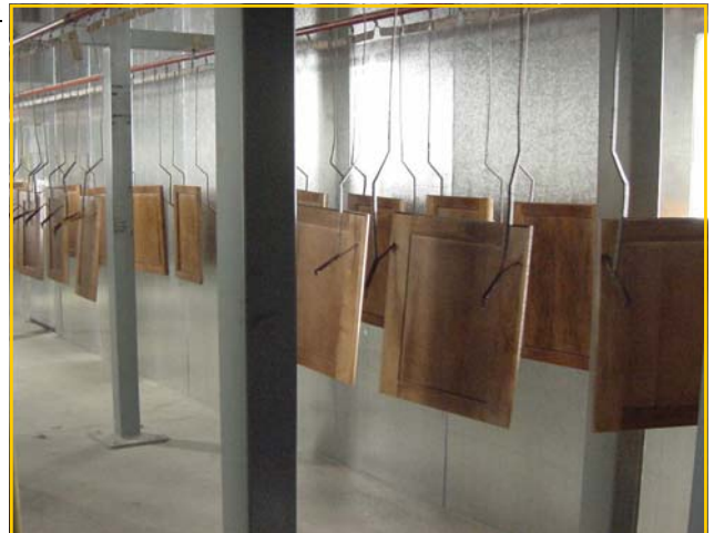
Lighted Flash Enclosure to Capture Evaporating Solvents.